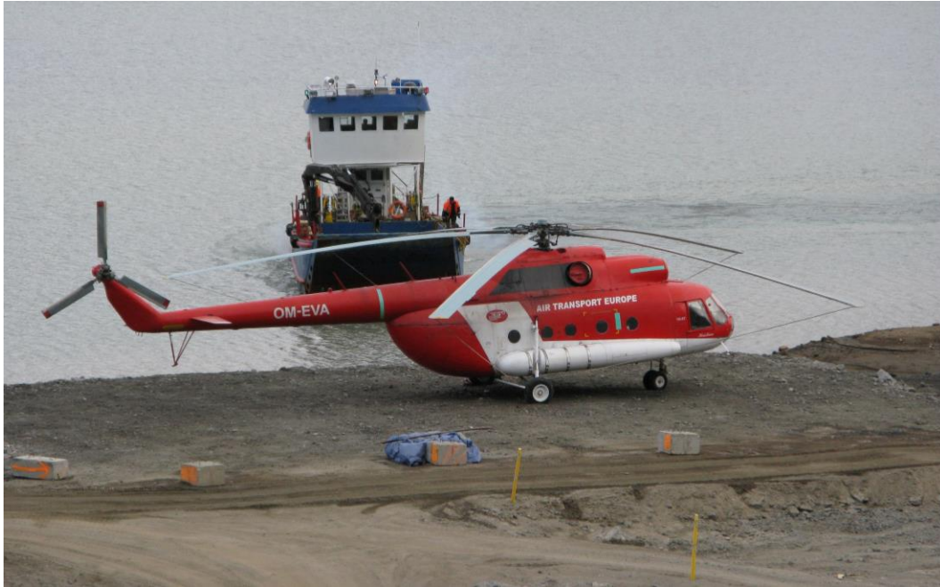
Fig. 5. Ilulissat Hydroelectric Project – the way to travel...

Equipment for the Project was mainly procured from European manufacturers. As a general rule, the equipment was transported to Ålborg in Denmark and shipped or transported by air from there to Sarfac and Ilulissat. Ship and barges were then used from these intermediary storages. The heaviest pieces of equipment included the turbines, the generators with stator and rotor – about 35 tons, the transformers – about 25 tons, the steel liners for the penstock – about 9 m, valves and gates. Transport by sea to the construction site was only possible from June to November and logistics and construction activities had to be planned accordingly. Transportation of these elements to the construction site was most critical because of the strong currents and high tide – about 5 m - setting limits on the type of ships that could be used, see Figure 6. The Project could not afford to lose or damage these long lead items during transportation to the site. It can be mentioned here that during transport of one of the heavy pieces of equipment, it turned out that an iceberg was on the ship planned trajectory. The deviation required to avoid the iceberg almost put the ship at risk when it entered the strong current of the fjord but this went well in the end thanks to the experienced contractor mandated for these activities.