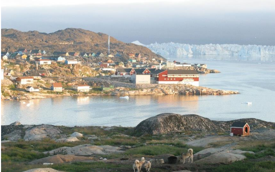
Fig. 1. Ilulissat

The project had already been identified in the 1980's as part of a national search for hydropower potentials in populated areas in Greenland. It is not until 2008 that the decision is taken to realize the project and Nukissiorfiit, the Greenland's national power company, tendered the project as a turn-key. The Icelandic EPC contractor Ístak, daughter firm of Pihl og Søn in Denmark, with Verkís, Icelandic consulting engineers, as the main consultant, came up with the most attractive proposal and was selected for implementation of the project. The Ilulissat Hydroelectric Project (22.5 MW) is the third one of this type in Greenland realized by Ístak as the main contractor, following the realization of the Qorlortosuaq 7.5 MW hydropower plant in operation since 2006 and the Sisimiut 15 MW hydropower plant in operation since 2009. Among the features that made the proposal attractive was the early commissioning of the first of its three turbines, enabling Nukissiorfiit to step down production from its diesel generators earlier than initially planned.