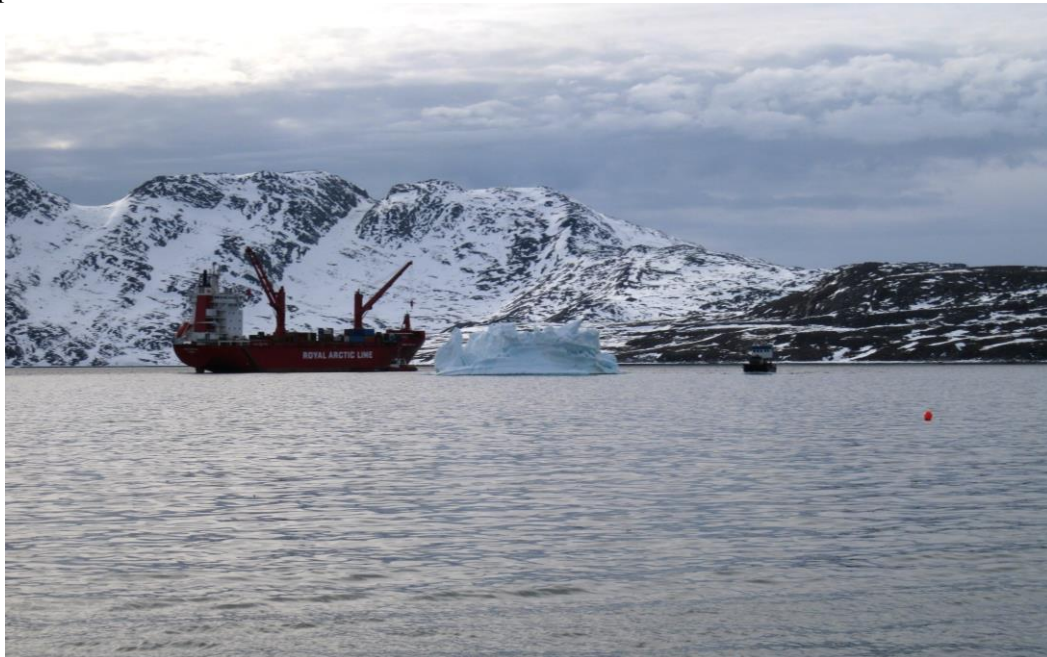
Fig. 6. Shipping of equipment to the site

Equipment for the Project was mainly procured from European manufacturers. As a general rule, the equipment was transported to Ålborg in Denmark and shipped or transported by air from there to Sarfac and Ilulissat. Ship and barges were then used from these intermediary storages. The heaviest pieces of equipment included the turbines, the generators with stator and rotor – about 35 tons, the transformers – about 25 tons, the steel liners for the penstock – about 9 m, valves and gates. Transport by sea to the construction site was only possible from June to November and logistics and construction activities had to be planned accordingly. Transportation of these elements to the construction site was most critical because of the strong currents and high tide – about 5 m - setting limits on the type of ships that could be used, see Figure 6. The Project could not afford to lose or damage these long lead items during transportation to the site. It can be mentioned here that during transport of one of the heavy pieces of equipment, it turned out that an iceberg was on the ship planned trajectory. The deviation required to avoid the iceberg almost put the ship at risk when it entered the strong current of the fjord but this went well in the end thanks to the experienced contractor mandated for these activities.