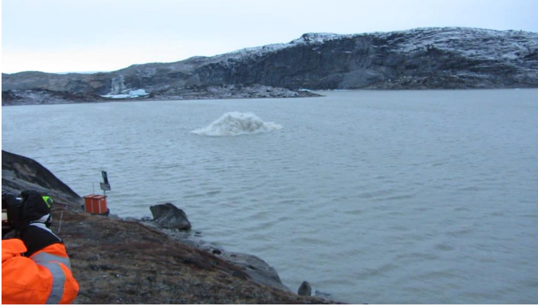
Fig. 7. Air reaching the surface after blasting the cap of the cave