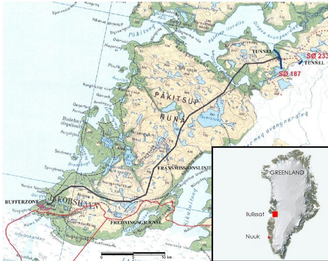
Fig. 2. The Ilulissat Hydroelectric Project – location.

The project harnesses the discharge from two natural glacial lakes in the area “Paakitsup Akuliarusersua” with storage obtained by drawdown of the water levels by respectively 30 and 50 m from the present. Water is diverted from the upper lake through a diversion tunnel controlled by valves. The lower lake serves as the intake reservoir and from there water is diverted through an intake structure equipped with bulkhead gates. From these the water is conveyed through an inclined unlined headrace tunnel, partly in permafrost, down to three 7.5 MW Francis turbines on a vertical axis in an underground powerhouse. The powerhouse is at sea level some 400 m inside the mountain. Adjacent to the powerhouse is a transformer and a switchgear cavern. Water from the turbines empties into a tailrace tunnel which again opens into the sea. Figures 3 and 4 below propose section showing the hydropower plant concept and an overview of the main power plant elements.